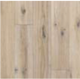
1 OAK OYSTER