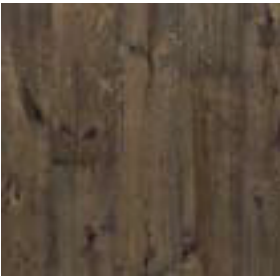
1 OAK OLD OLIVE