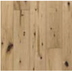
1 OAK CAMINO