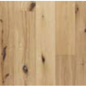
1 OAK STRAW