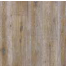
1 OAK LINEN