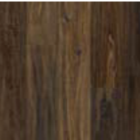
1 OAK EARTH