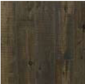
1 OAK SAW